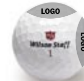
Single Pole: North or East

Your logo can be printed in these positions on the ball: