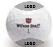
Double Pole: North and South

The WILSON STAFF BAGS, HOLDALL and TRAVEL COVER have a circular embroidery area of 110mm diameter